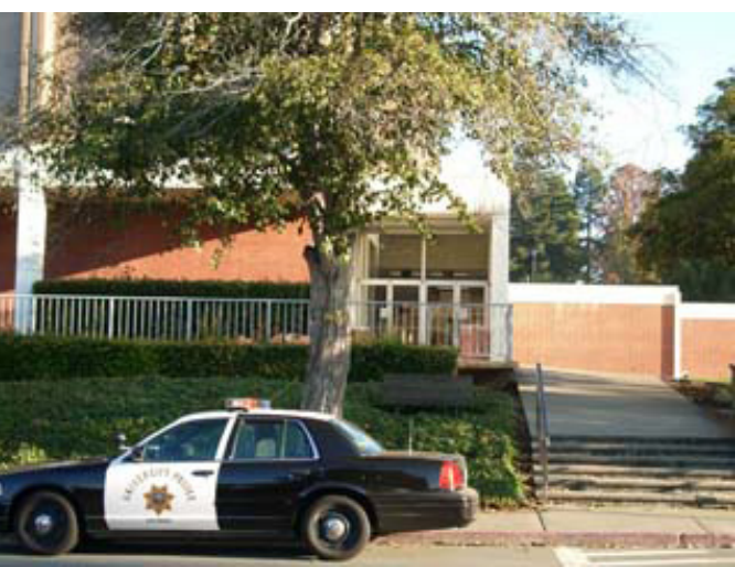
Entrance to PE Building at West Loop Road